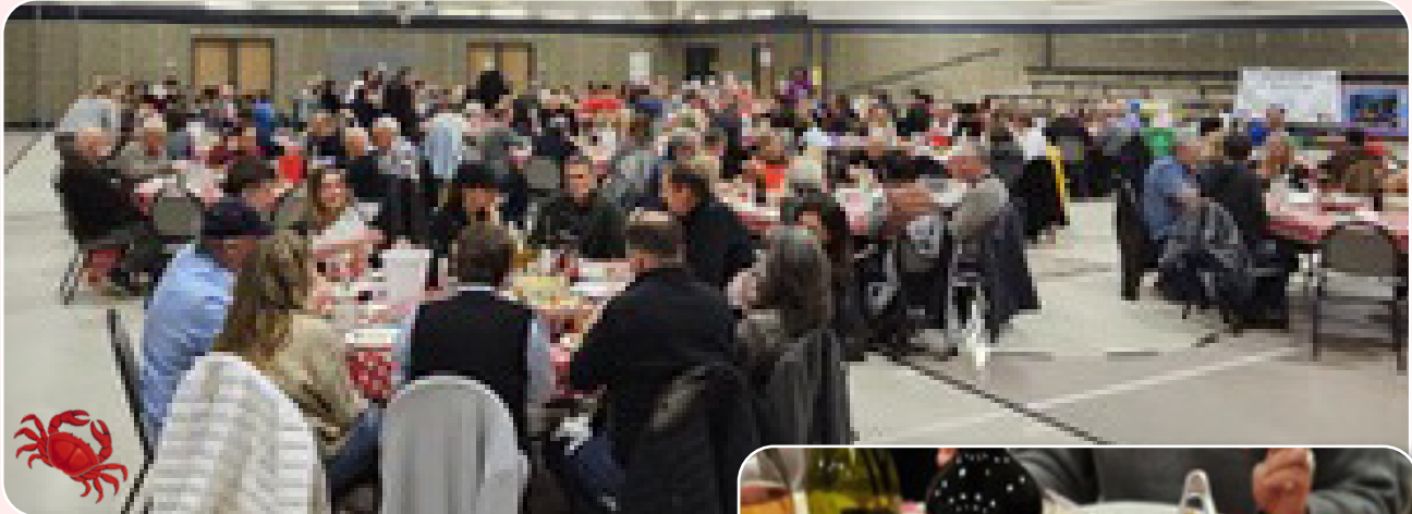
Full House. Close to 180 people