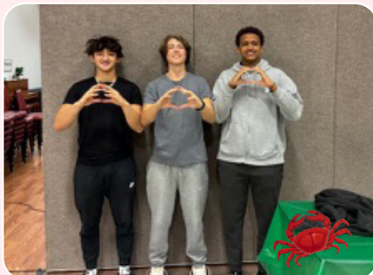
Thank you to the O'Dea students who helped set up